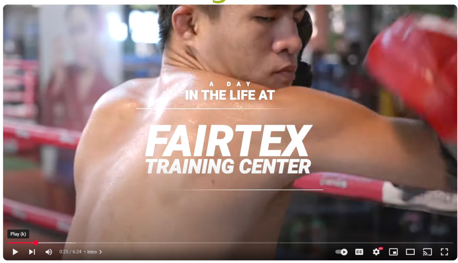
A Day Of Training At The World Class Fairtex Training Center in Thailand